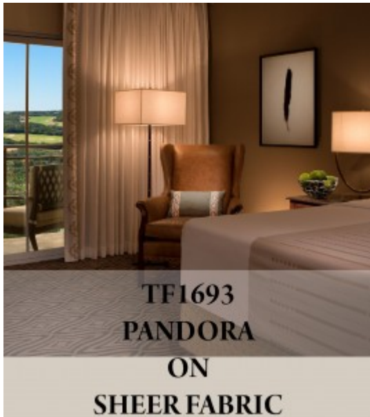
TF1693 PANDORA ON SHEER FABRIC