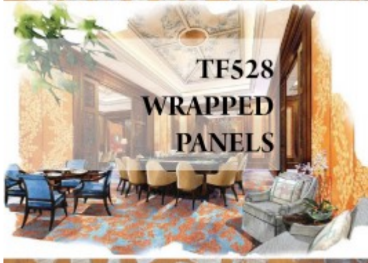
TF528 WRAPPED PANELS