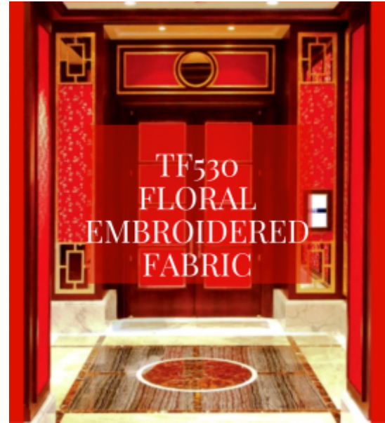
TF530 FLORAL EMBROIDERED FABRIC