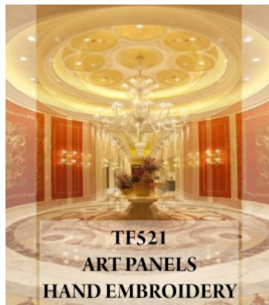
TF521 ART PANELS HAND EMBROIDERY